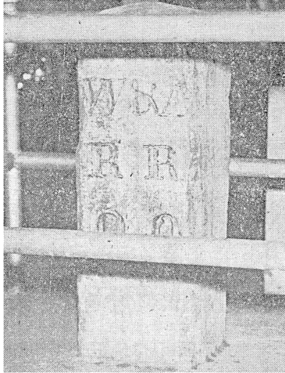
Figure 1—ZERO MILE POST OF THE W&A RAILROAD 3

Western & Atlantic mile posts were “a square stone post about one foot in diameter and three foot high bearing the inscription ‘W.&A.R.R. #00’” at Atlanta to #138 at Chattanooga. Each mile a new post was set (#11 still stands in Vinings). 4